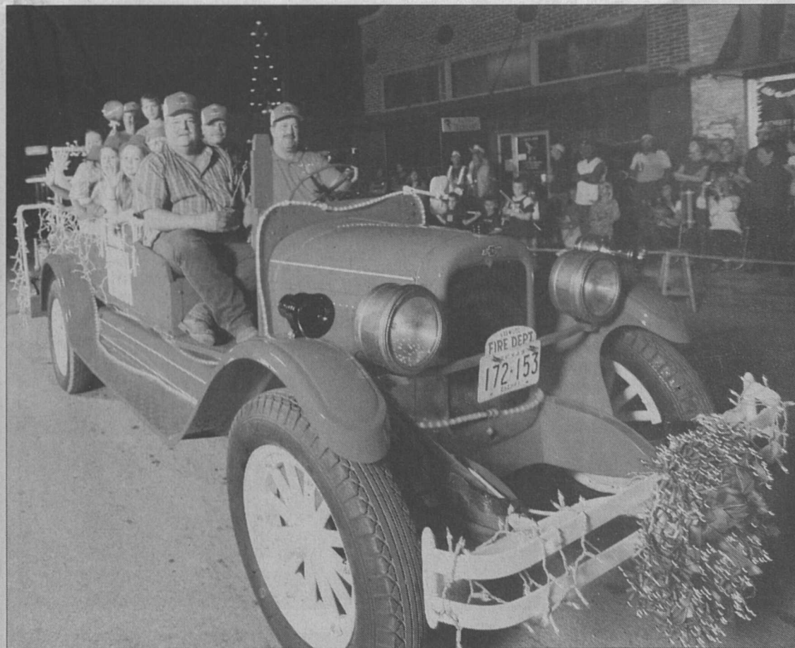
Garwood Fire Department won the Deck the Hose Category.