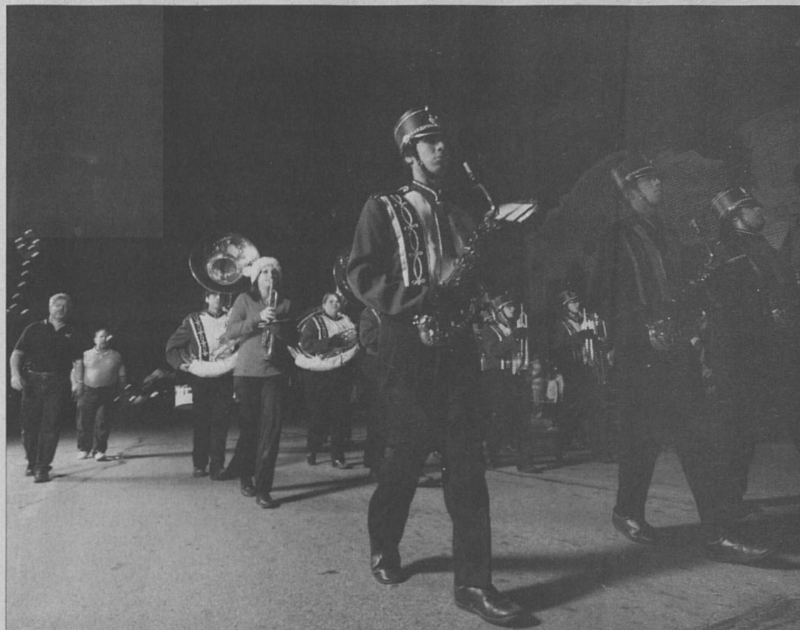
The Rice High School Marching Band won the Best Walking Category.